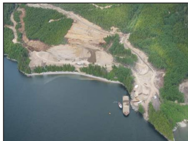
Swamp Point Aggregate Project