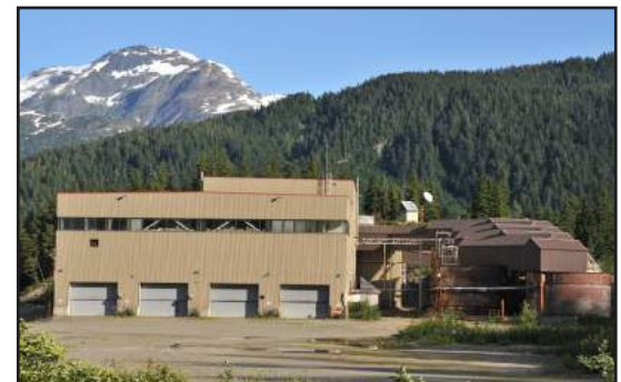
Mill at the Premier property